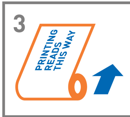
Right hand edge leading/outside wound